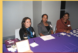
OBT Staff members that participated at the event.

To view OBT's new website visit www.obtjobs.org . To contact Lost in Brooklyn Studio, go to www.lostinbrooklyn.com .