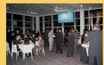
Con Edison sponsored OBT's Website Launch Event on November 15, 2007