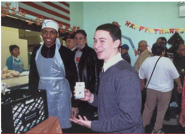
Students volunteering at United Senior Center