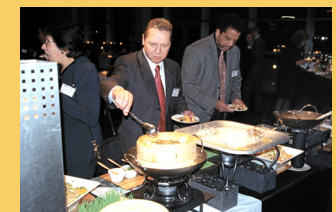
Stage 6 @ Steiner Studios - a wonderful venue