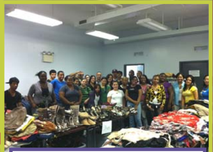
Service Learning Dress For Success September 2010