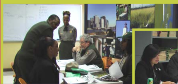
Job Fair OBT Bushwick October 2010