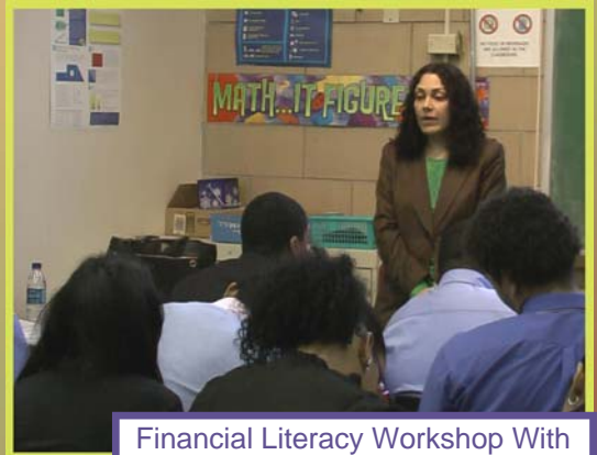
Financial Literacy Workshop With Amalgamated Bank November 2010