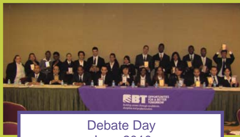
Debate Day June 2010