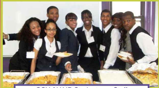
OSY & YAIP Students vs. Staff Potluck Competition November 2010