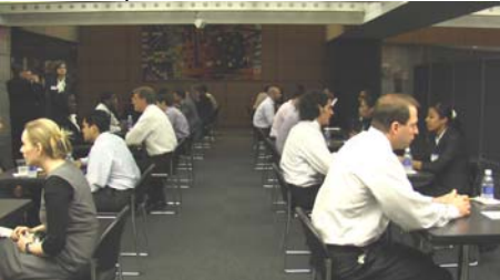
Speed Networking with Morgan Stanley

OBT recognizes that networking is an essential component of any job search, and an important business skill since 80%