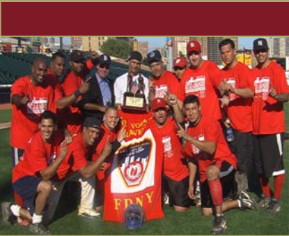
Battle of the Badges 2010